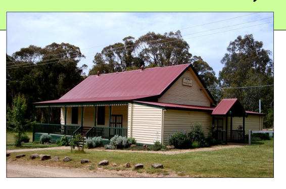
15 Tolmie-Mahaikah Rd, Tolmie

(officially, the Tolmie Mechanics Institute)